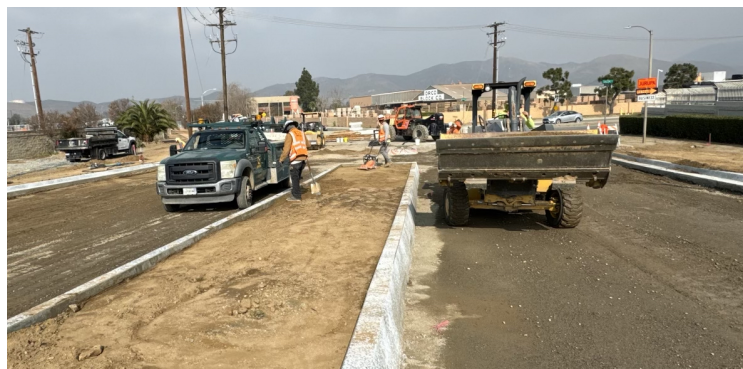
Crews continue work on intersection improvements including constructing the median, curb and gutter, at Rutile Street and Van Buren Boulevard.

STAY CONNECTED Construction Hotline 800.679.9570 www.JurupaGradeSeparation.com