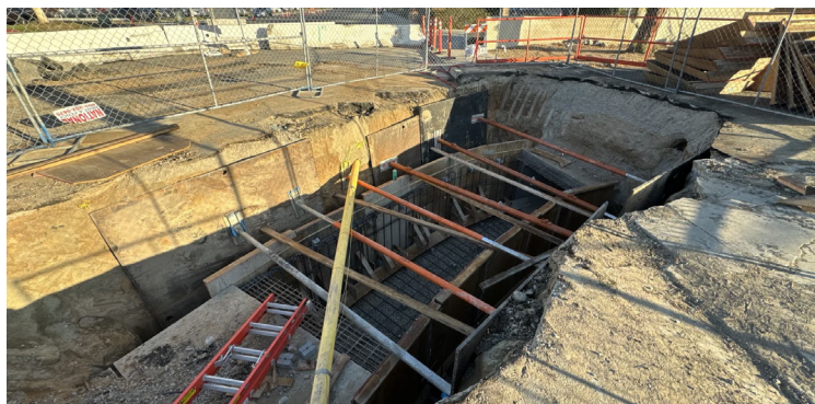
Work continues on the underground concrete storm drainage system on Felspar Street. One traffic lane is open in each direction.