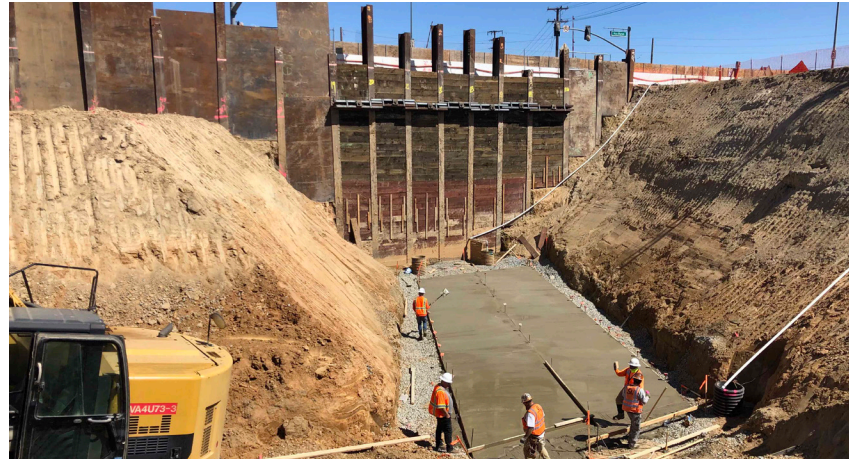
Crews working on Jurupa Road next to Van Buren Blvd.