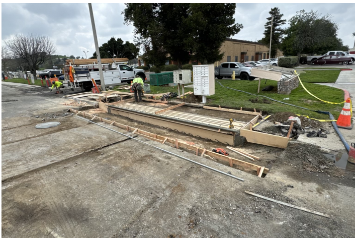
Crews completed construction on 6 new storm water catch basins on Felspar Street.