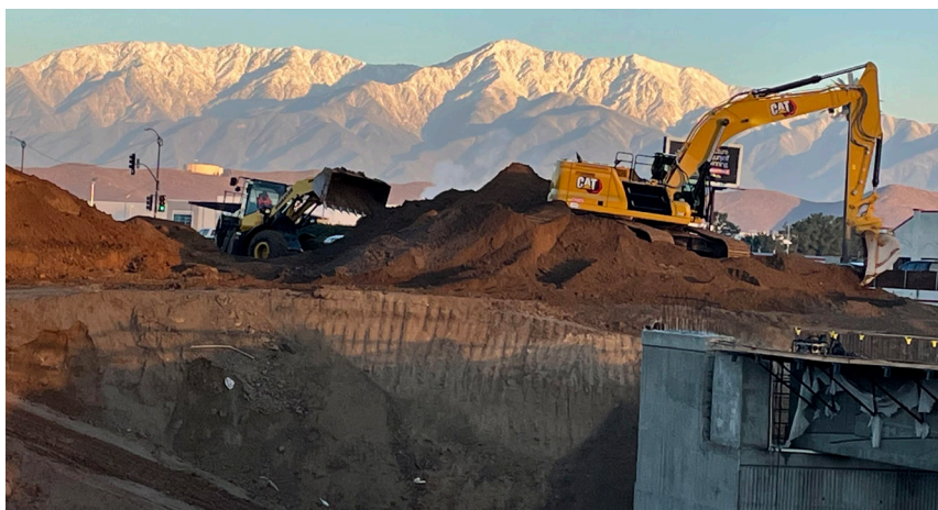
Snowy mountains are in the background of the ongoing earthmoving operation to backfill the north end of the Van Buren Boulevard bridge support system.

STAY CONNECTED Construction Hotline 800.679.9570 www.JurupaGradeSeparation.com